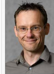
Vote: Vladimir Skokov